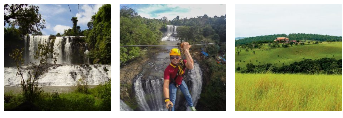
Zipline + hiking