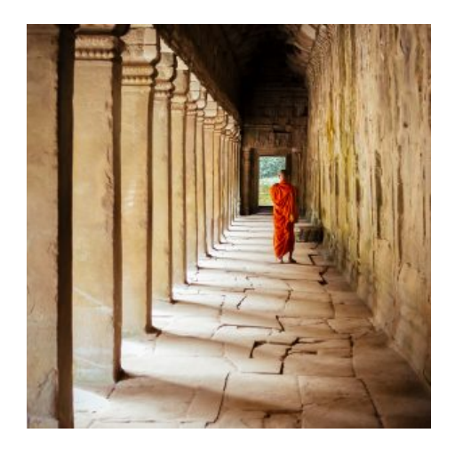
DAY 5: Siem Reap